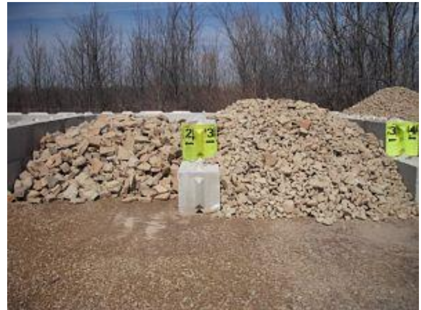
Decorative Stone / Rip Rap

Ideal for large excavation and contractor projects