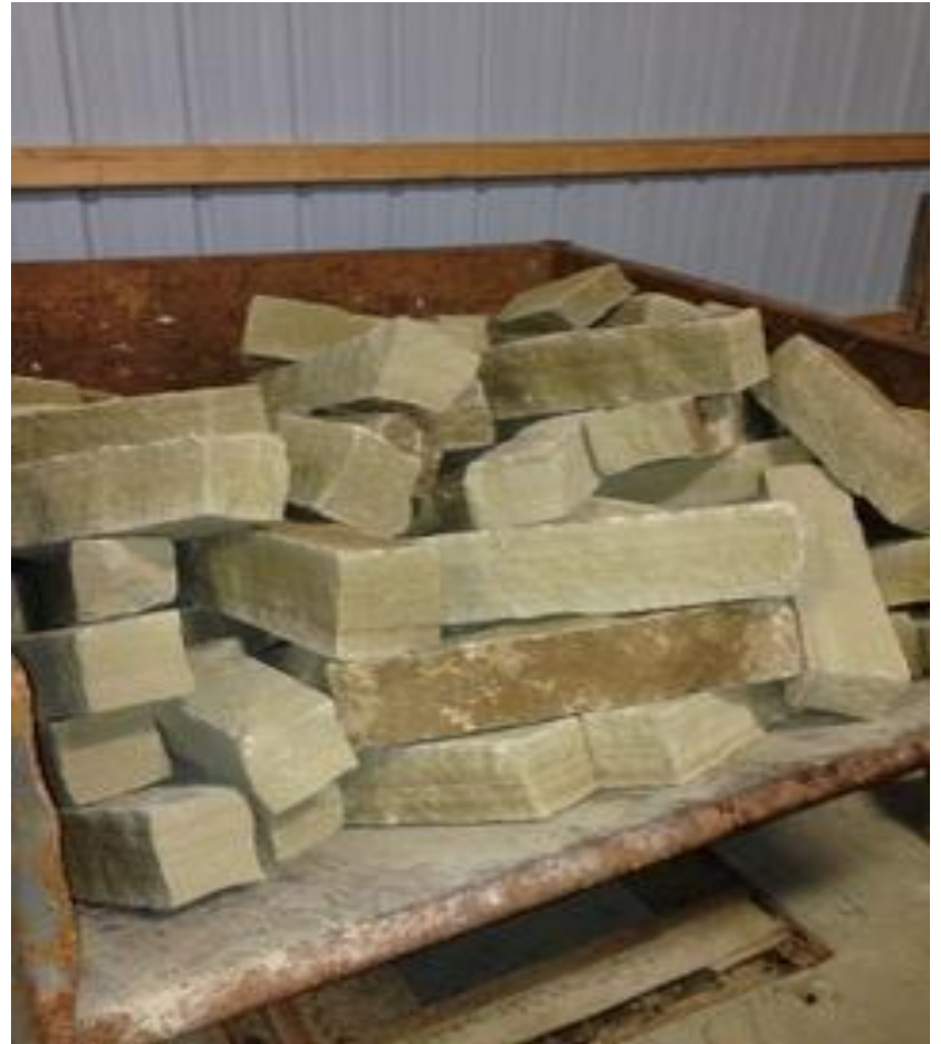
Full Bed Depth Veneer