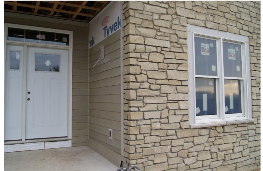
Thin Veneer Stone