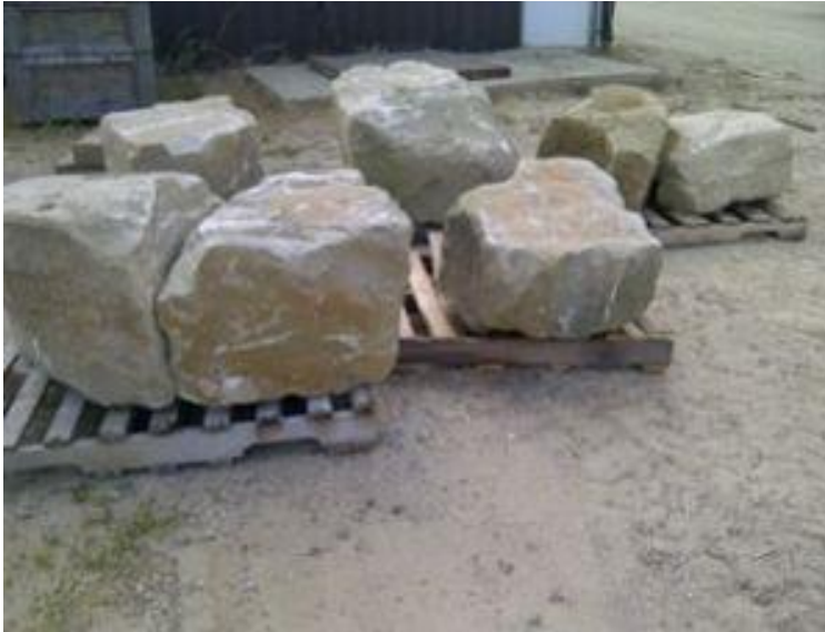
Sandstone Chunks - 10" – 20" thick